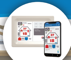
Smart Touch controller and app