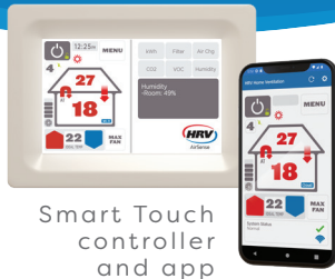
Smart Touch controller and app